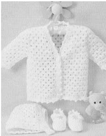
Lacy Set to Crochet 11 shown on page 2

Hdc2tog – (Yoh. Draw up a loop in next st) twice. Yoh and draw through all loops on hook.